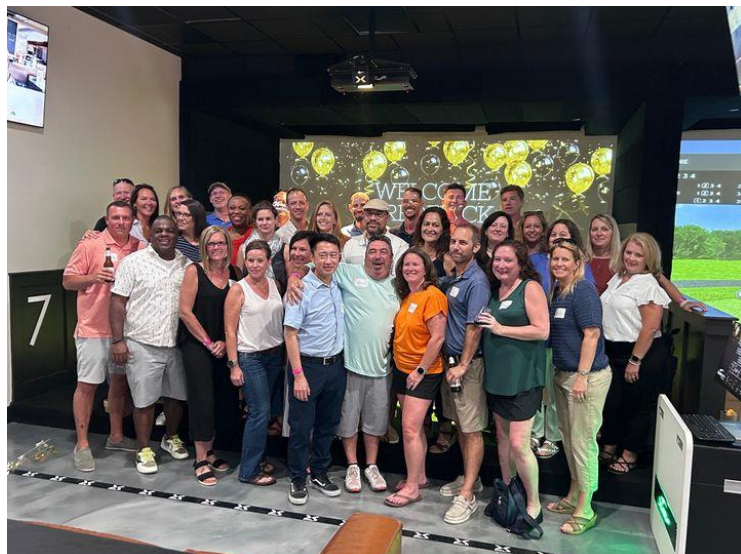
FHS Class of 1994 30 th High School Reunion. Great times seeing old friends and wonderful job by the ladies to organize.

The boys (and girls) are all going to go through the same things together as they are leaving home for the first time in their lives. They are breaking out of their cocoon and are going on their OWN journey through life.